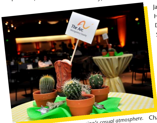
Boots, hats and cacti set the evening's casual atmosphere.