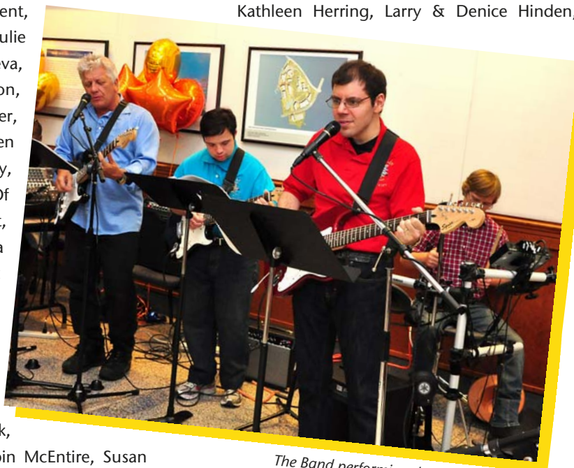
The Band performing during the reception.