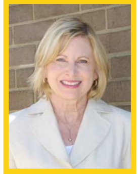
New Board Members