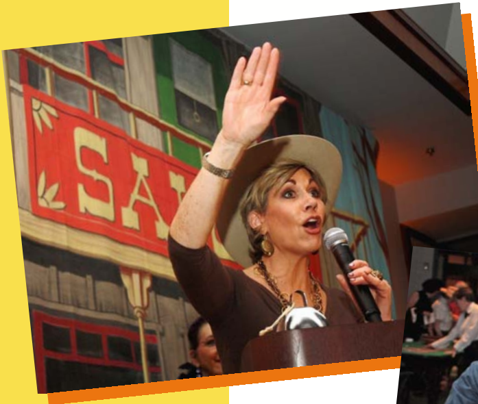
Casino Night photos courtesy of Ann Maas Photography and Marc Fitzsimmons.