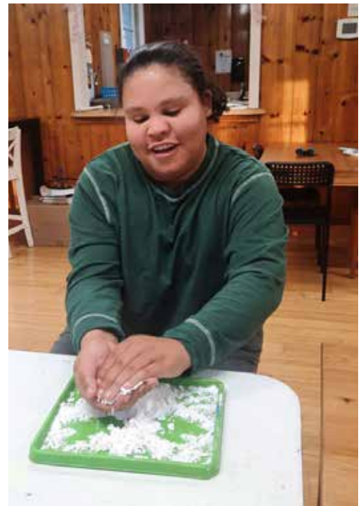
A student at After All makes "snow" using shaving cream and baking soda.

We are excited to share that The Arc is piloting a new model of the After All program at a brand new location in Germantown, aimed at expanding access for families across the county. We look forward to sharing more details as this project evolves.