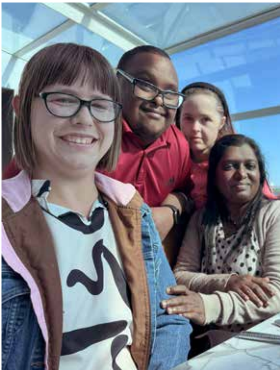
Meaningful Day aboard the Odessey Washington.

Employment & Meaningful Day has been busy in every way! The Community Employment Specialists have been working on new training workshops for people supported that will include work ethics, communication in the workplace, and financial literacy.